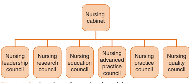
Figure 4–2 Legislative/hierarchical model.