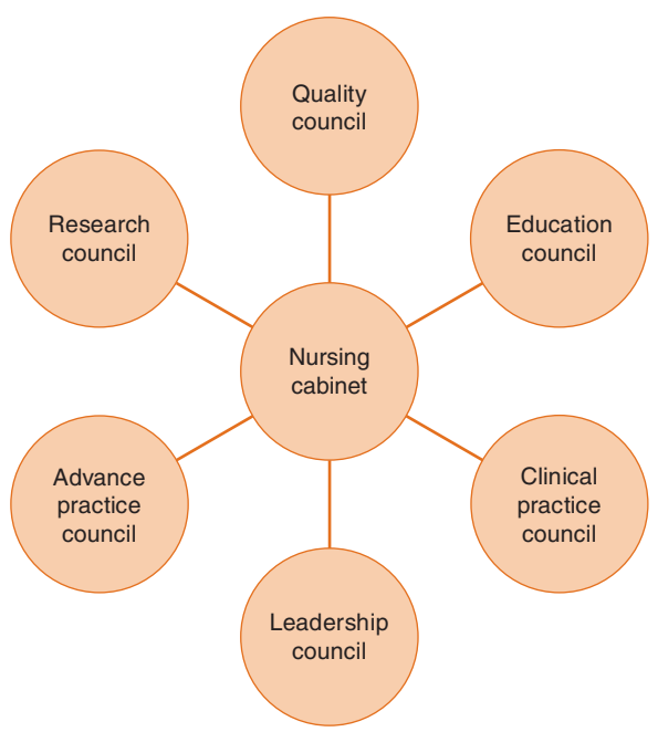
Figure 4–1 Typical shared governance model.